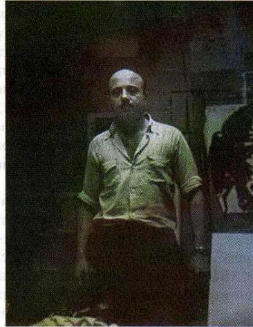
Boris Lurie RFK Center, Spazio SUC, at 1st Floor, Piazza delle Murate, Florence