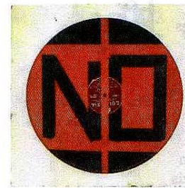
01. Works captions:

Press-office: Propaganda Mordini press: tel. +39 342 5829365 propaganda.mordini@gmail.com propaganda-press.blogspot.it